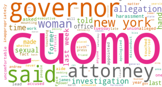
Gov. Andrew Cuomo Faces Sixth Sexual Misconduct Allegation: Report