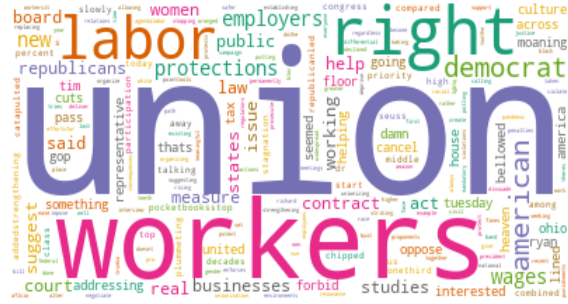
House Passes Labor Rights Expansion, but Senate Chances Are Slim