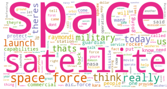
Opinion | I Asked the Head of Space Force What the Agency Has Done for Me Lately